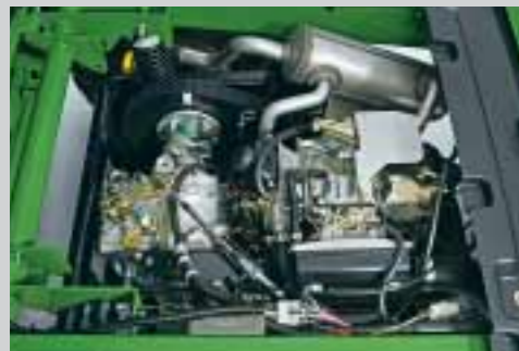
Power up. The new, larger diesel engine produces a full 854cc of performance (while being quieter than ever).