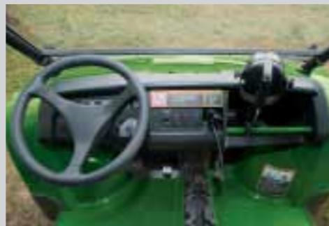
Control at your fingertips. Dashboard puts all colour coded controls within easy reach for superior operator convenience.