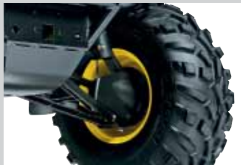
Stop on a dime. Long-lasting hydraulic disc brakes feature a dual circuit master cylinder and larger callipers for ultimate stopping power.